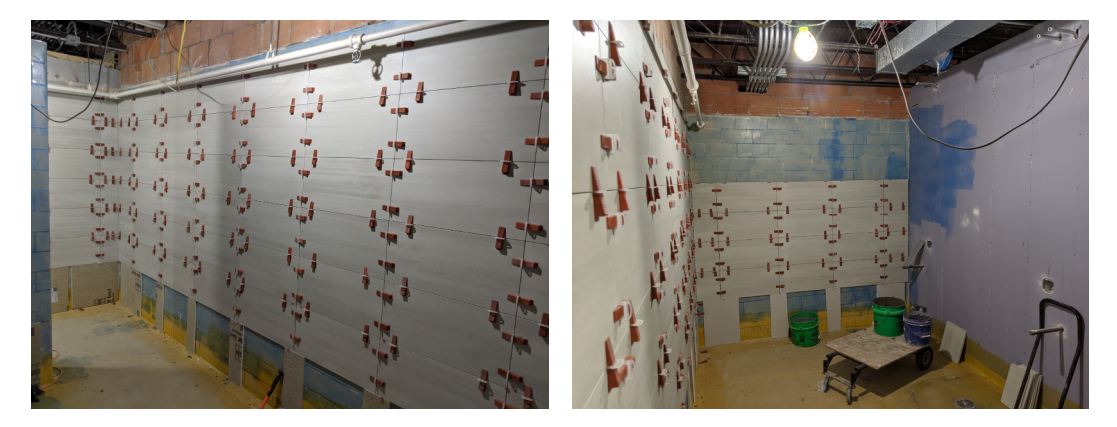
Sheridan Hills – Reception and Nurse area progress.

Sheridan Hills – C-wing multi-user Toilet Room tilework in progress.