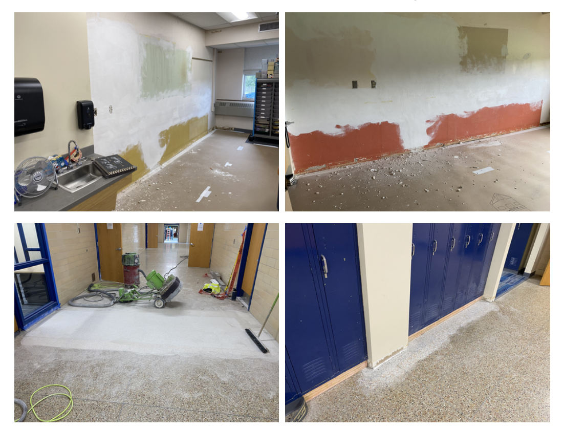
STEM – Corridor Wall Covering and Mop Sink