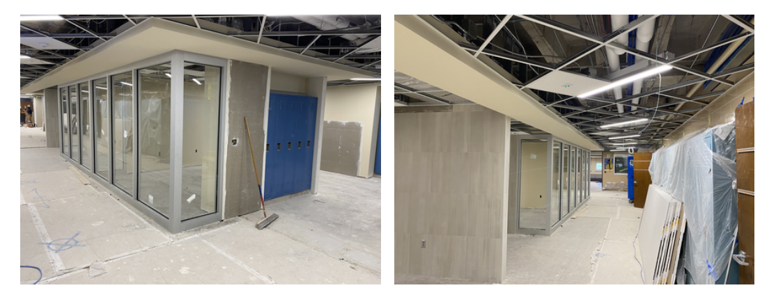
Middle School – Casework and Ceiling Installation in Classrooms

Middle School – Third Level Resource and Breakout Space Ceiling and Glass Installation