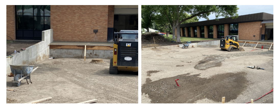
High School - New District Parking Lot Grading and South Basement Athletic Wall Infill