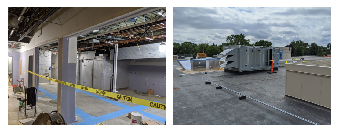
Centennial –Reception and Nurse area progress.

Centennial – Kitchen progress. Rooftop mechanical units set in place.