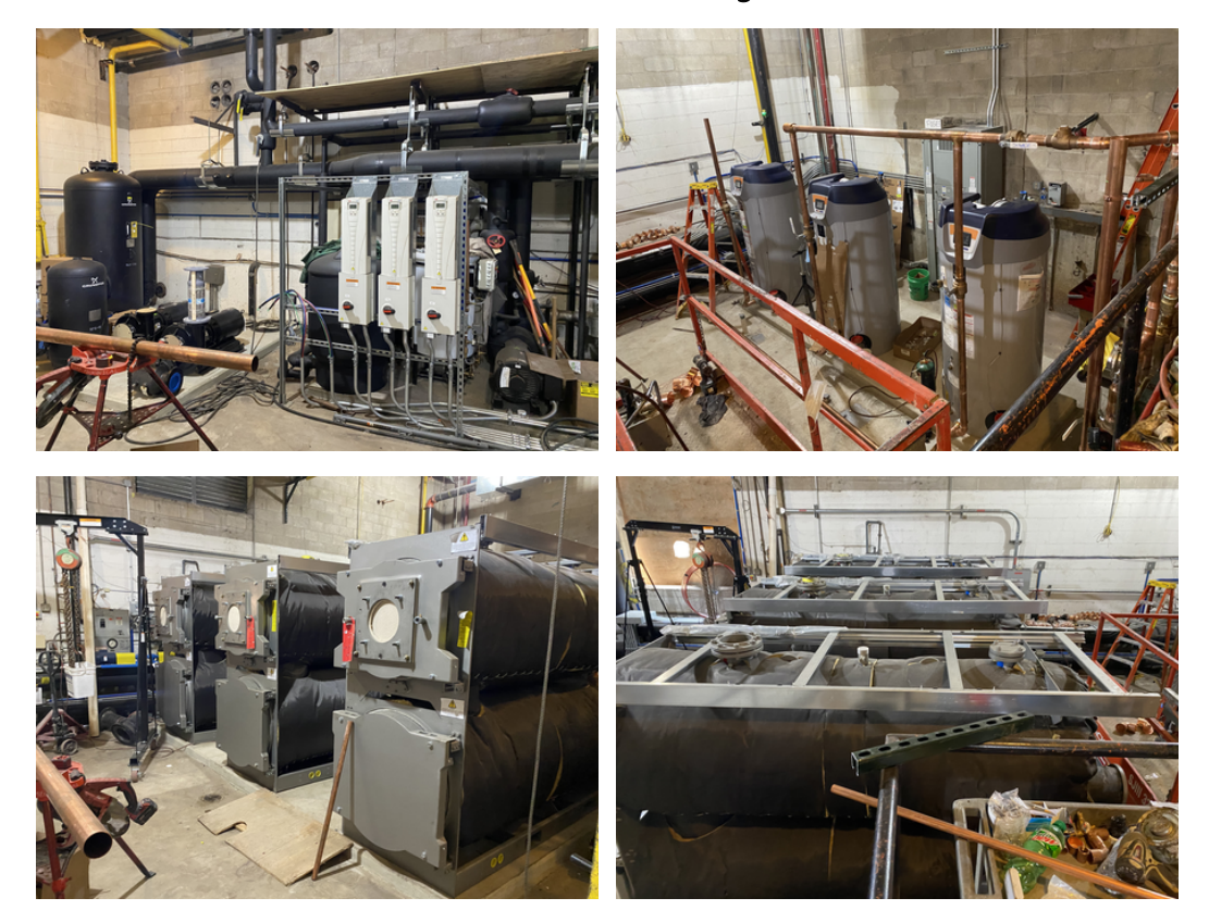
STEM – Dishwash Equipment/Ansul System Installation