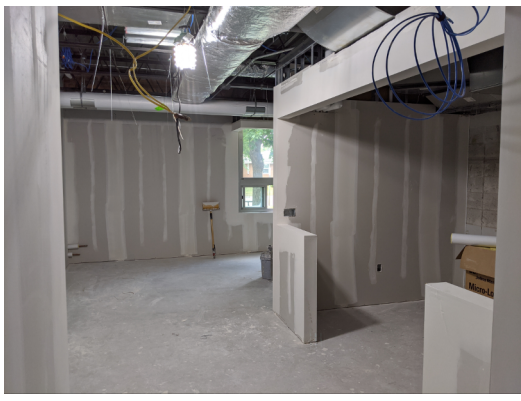
Sheridan Hills – SPED Area progress. C-wing Level 2 classroom progress.