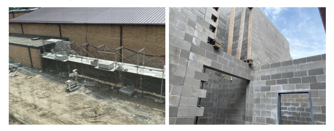
High School – Area P Link Exterior Finish and Interior Drywall