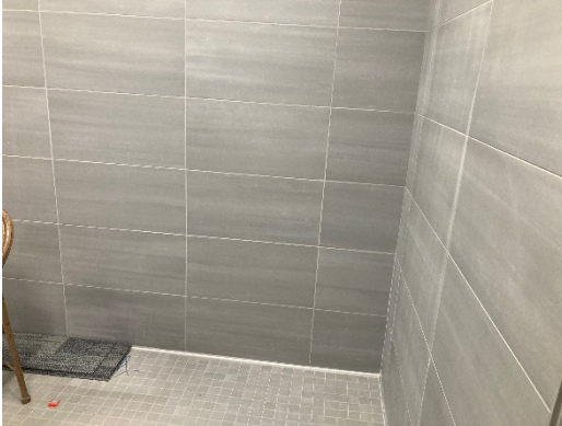
Middle School – Loading Dock Bathroom Final Floor and Wall Tile Installation